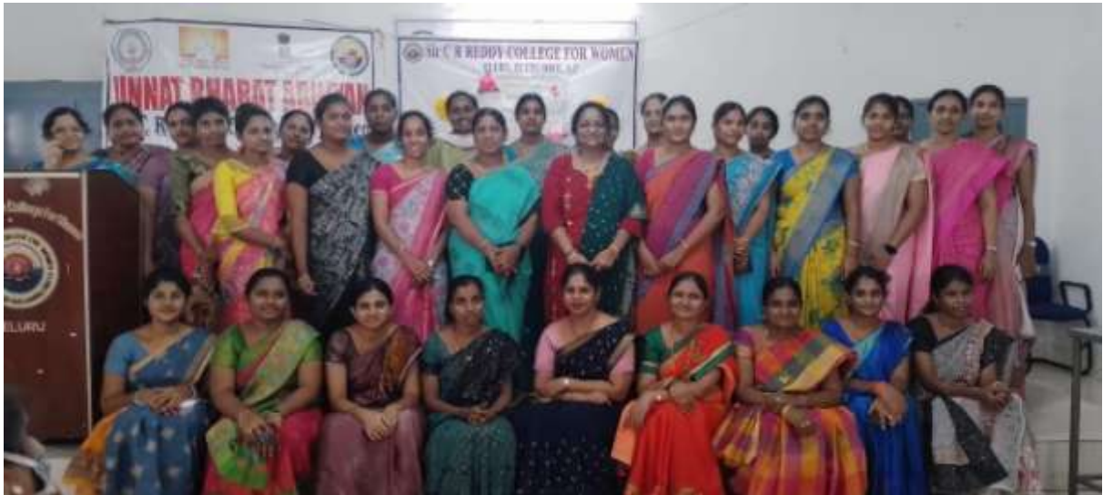
OLD STUDENTS OF SIR CRR COLLEGE FOR WOMEN WITH