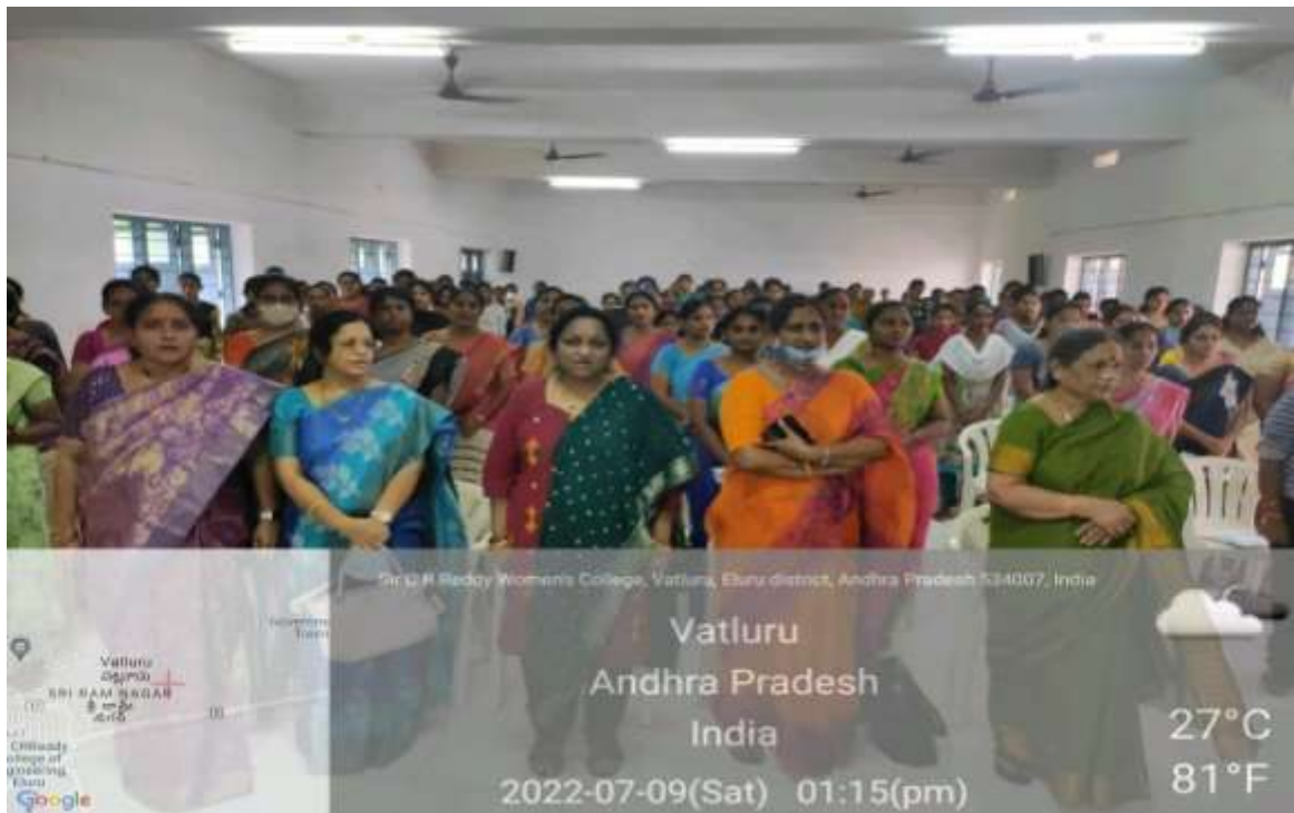
Closing the Session